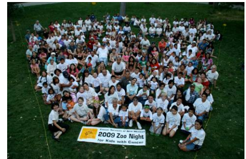
2009 Zoo Night for Kids w/ Cancer

In July, over 450 people participated in our Zoo Night for Kids with Cancer . Once again, we invited every current and former pediatric cancer patient in New Mexico, their parents, and siblings, to attend at no charge. We took over Albuquerque's Rio Grande Zoo for a fun-filled evening that included dinner, a sing-along with staff from the UNM Pediatric Oncology program, exhibits by community groups, face painting, ice cream, door prizes, goodie bags, T-shirts and more. Things have certainly changed since our first "Aquarium Day" in 2002, attended by fewer than 50 people!