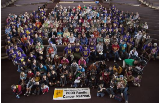
Fall 2009 Family Cancer Retreat

We continue to receive tremendous support for the Family Cancer Retreats from New Mexico's oncology community. Each of our program agendas in 2009 included 35-40 speakers and presenters, including 12-15 of New Mexico's leading physicians. Over 40 oncology groups, cancer services agencies, and other organizations/individuals referred people to the program last year. Our promotional materials were displayed in virtually every oncology clinic in the state and in many cases physicians, nurses, social, workers, and other professionals personally encouraged specific families they felt would benefit to attend.