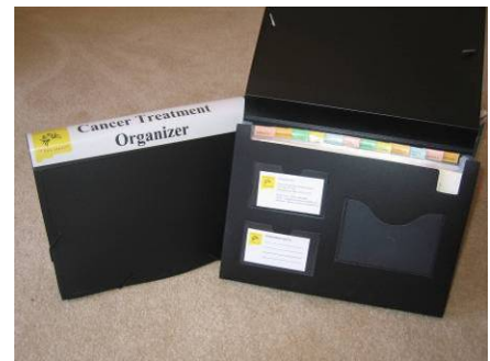
Cancer Treatment Organizer

Through LIPA, we also distribute copies of our Cancer Treatment Organizer statewide. This free recordkeeping tool designed by a New Mexican cancer survivor offers a simple system for keeping cancer-related records organized and easily accessible. Over 380 people participated in our LIPA program and/or received our Cancer Treatment Organizers in 2009.