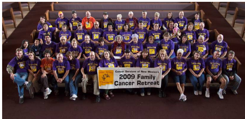
Fall 2009 Family Cancer Retreat Volunteers