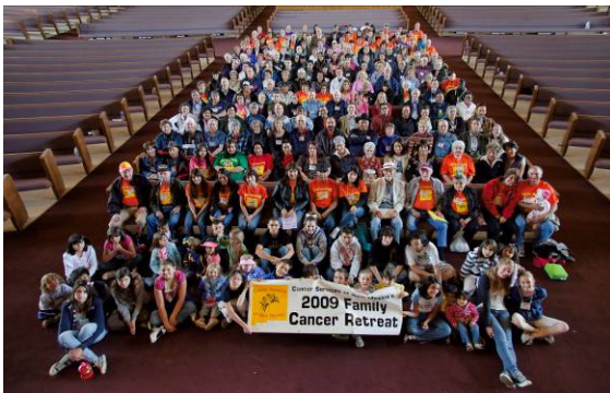
Spring 2009 Family Cancer Retreat

We continued to offer our Family Cancer Retreat twice a year in 2009, with nearly 500 people from over 200 New Mexican families attending these free programs in April and September. This is the largest general cancer education program in New Mexico, and the largest program of its type in the U.S. Each three-day retreat, held in Glorieta, NM, focuses on educating New Mexico's adult cancer patients/survivors and their loved ones on the process of surviving, from the difficulties of handling the initial diagnosis, through coping with therapy, through a variety of medical and social challenges relating to at-home care and the emotional issues associated with surviving. In addition to providing a temporary escape from the day-to-day challenges of living with cancer, the retreats foster development of supportive relationships between