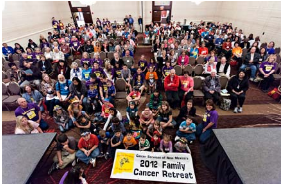
Fall 2012 Family Cancer Retreat

We continue to receive tremendous support for the Family Cancer Retreats from New Mexico’s oncology community. Each of our program agendas in 2012 included 35-40 speakers and presenters, including 15+ of New Mexico’s leading physicians. Over 40 oncology groups, cancer services agencies, and other organizations/individuals referred people to the program last year. Our promotional materials were displayed in virtually every oncology clinic in the state and in many cases physicians, nurses, social, workers, and other professionals personally encouraged specific families they felt would benefit to attend.