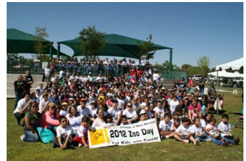
2012 Zoo Day

In July, close to 450 people participated in our Zoo Day for Kids with Cancer . Once again, we invited every current and former pediatric cancer patient in New Mexico, their parents, and siblings, to attend at no charge. We took over the park across from Albuquerque’s Rio Grande Zoo for a fun-filled carnival-like day that included lunch, face painting, dancing, singing, games, door prizes, goodie bags, T-shirts and more. Things have certainly changed since our first “Aquarium Day” in 2002, attended by fewer than 50 people!