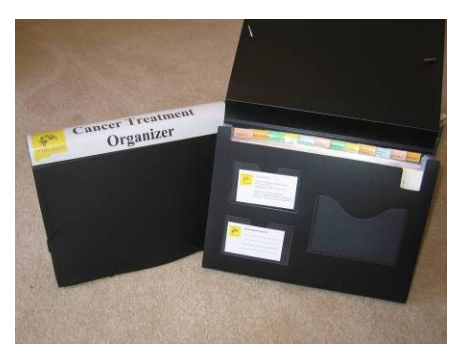
Cancer Treatment Organizer

The Cancer Treatment Organizer is a free recordkeeping tool that offers a simple system for keeping cancer-related records organized and easily accessible. The organizer contains sections for storing medical contacts, physician records, insurance paperwork and much more. Over 200 people participated in the LIPA program and/or received Cancer Treatment Organizers in 2007.