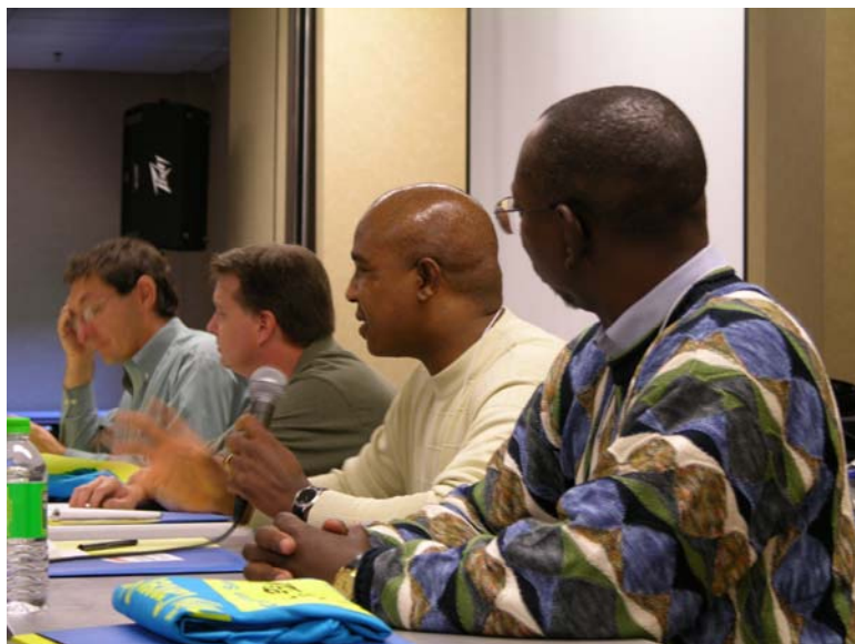
“Ask the Oncologist” Panel – 2004 Family Cancer Retreat

We also continue to work closely with other cancer services organizations around the state to coordinate programs and avoid duplication of effort.