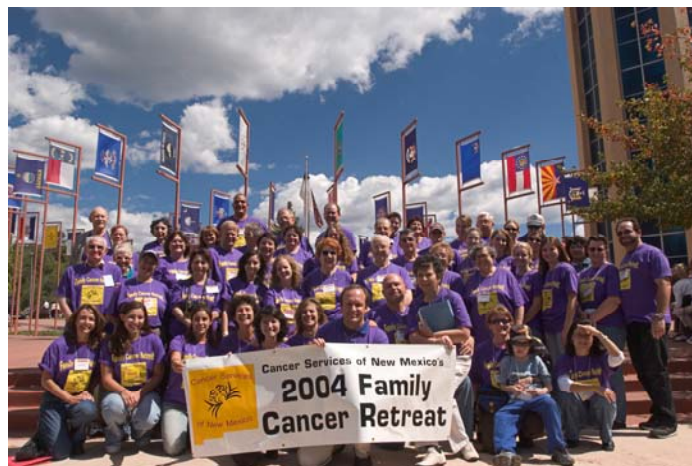
2004 Family Cancer Retreat Volunteers