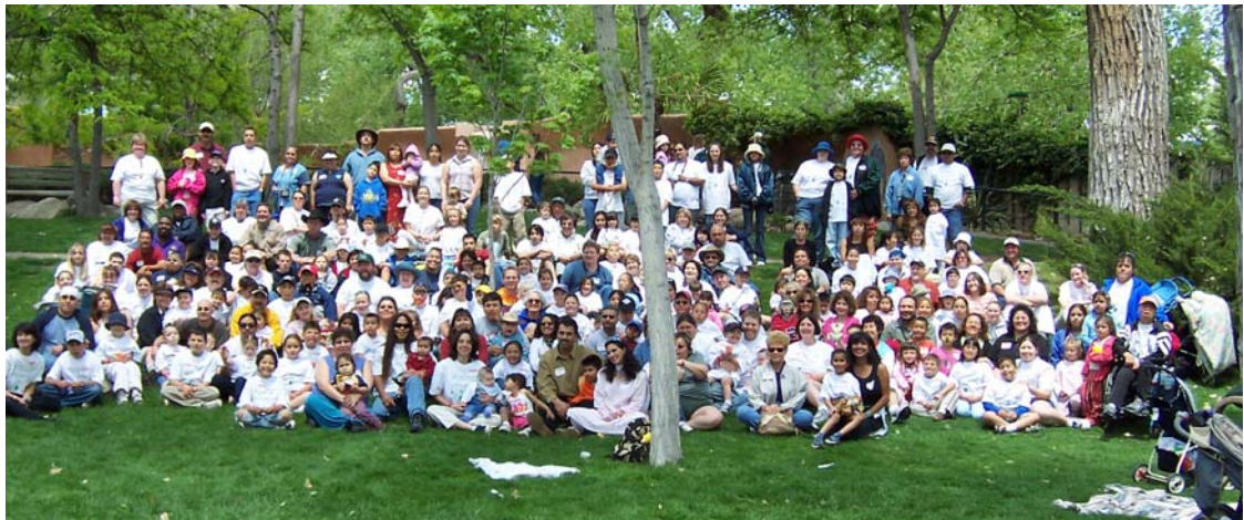
2004 Zoo Day for Kids with Cancer