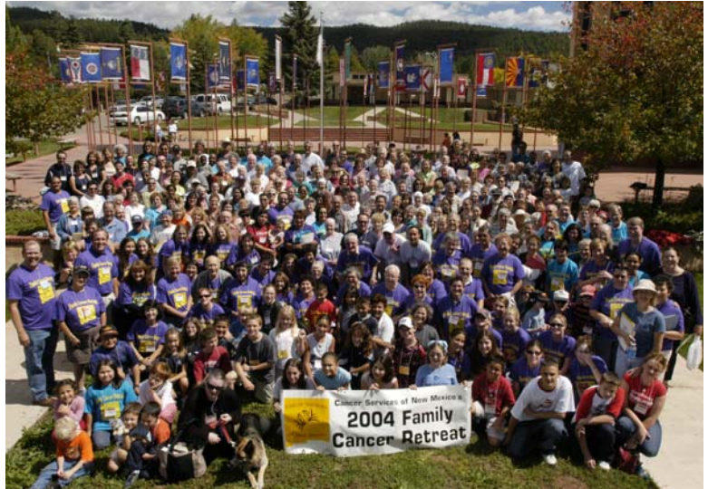
2004 Family Cancer Retreat Participants

We receive tremendous support for the Family Cancer Retreat from New Mexico's oncology community. Our program agenda in 2004 included over 35 speakers representing cancer services organizations around the state, including 14 of New Mexico's leading physicians. Over 40 oncology groups, cancer services agencies, and other organizations helped us recruit participants by displaying brochures and applications and, in many cases, having physicians, nurses, social workers, and other professionals personally encourage specific families they felt would benefit to attend.